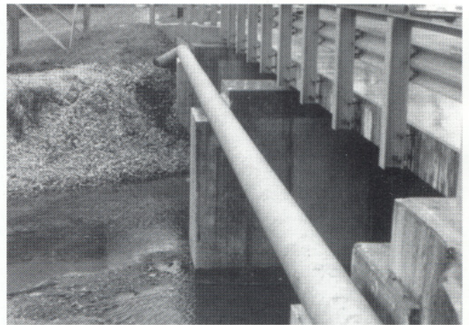
#2A Wax-Tape applied to bridge span, providing corrosion protection from road salt, physical damage and atmospheric corrosion.

Wax-Tape Primer is required prior to the application of the tape, particularly for surfaces that are cold, wet or rusty. It acts as a surface conditioner, by filling