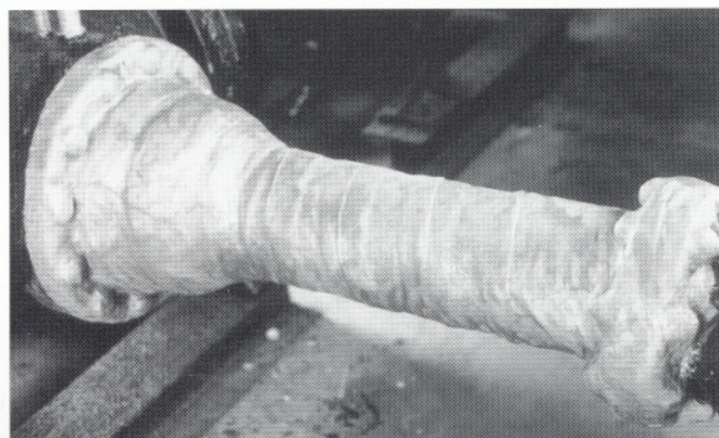
Sweating meter run pipe protected with #2A Wax-Tape.